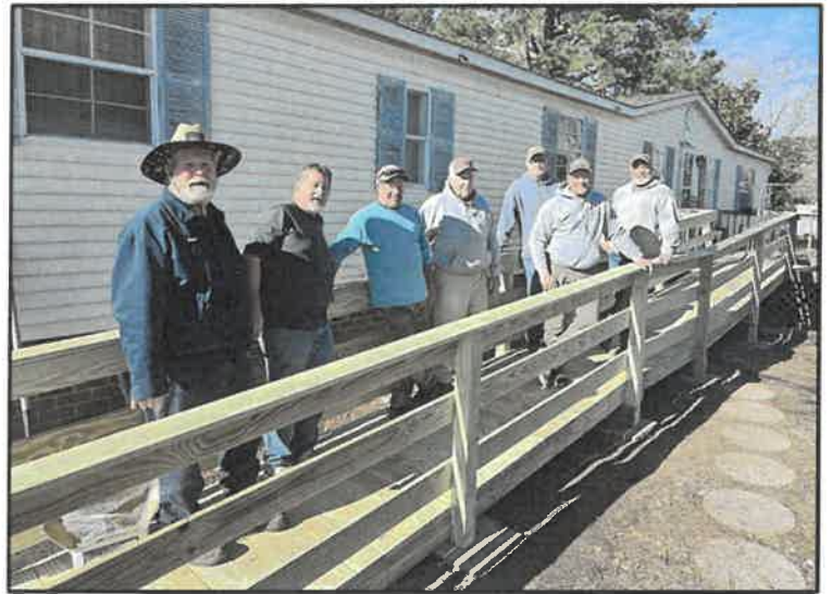
(connection: Olivet BC)