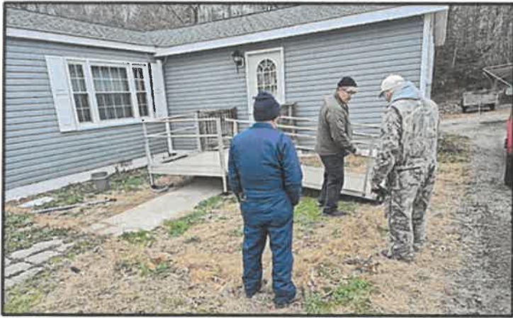
(connection: Lower King & Queen BC & Olivet BC).