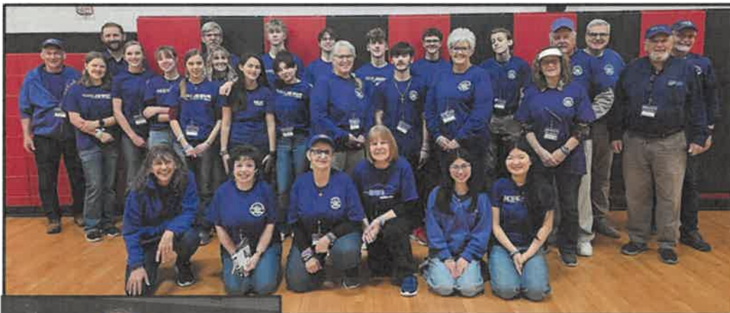
Hope teams delivering boxes