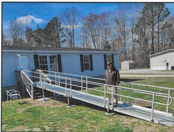
(Connection: Glebe Landing BC)