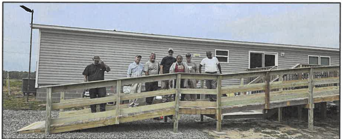
Connection: Saluda BC

“Not so with you. Instead, whoever wants to become great among you must be your servant, and whoever wants to be first must be your slave— just as the Son of Man did not come to be served, but to serve, and to give his life as a ransom for many.”