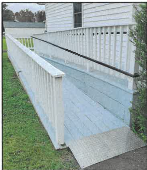
MTBA OFFICE, threshold ramp installed