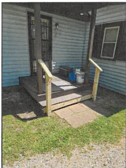
Hand railings installed, connection with Urbanna BC.

RAMP-IT UP MISSION on-going projects—May—August 2025. THANK YOU SERVANT HEARTED WORKERS! “Be shepherds of God’s flock that is under your care, watching over them—not because you must, but because you are willing, as God wants you to be; not pursuing dishonest gain, but eager to serve;” 1 Peter 5: 2