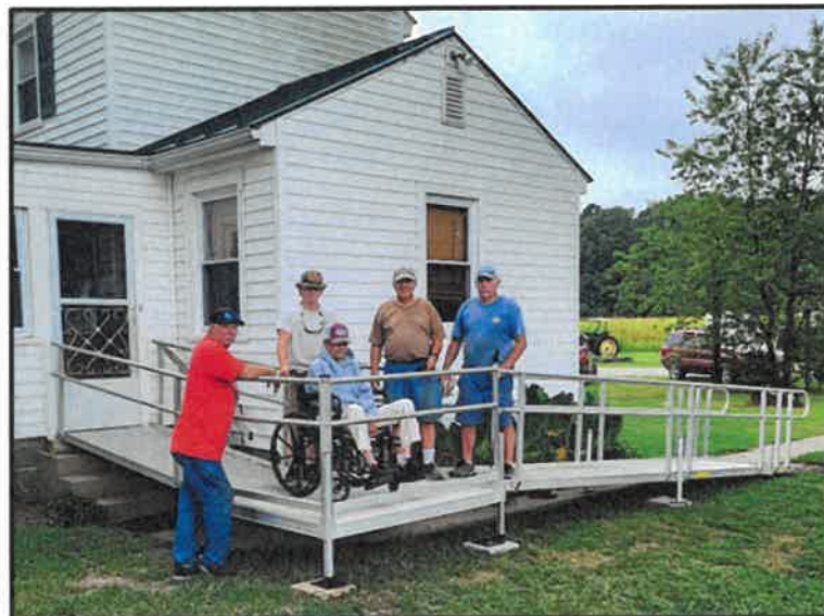
Connection with Corrottoman BC