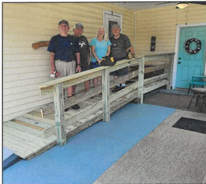
Connection with Urbanna BC