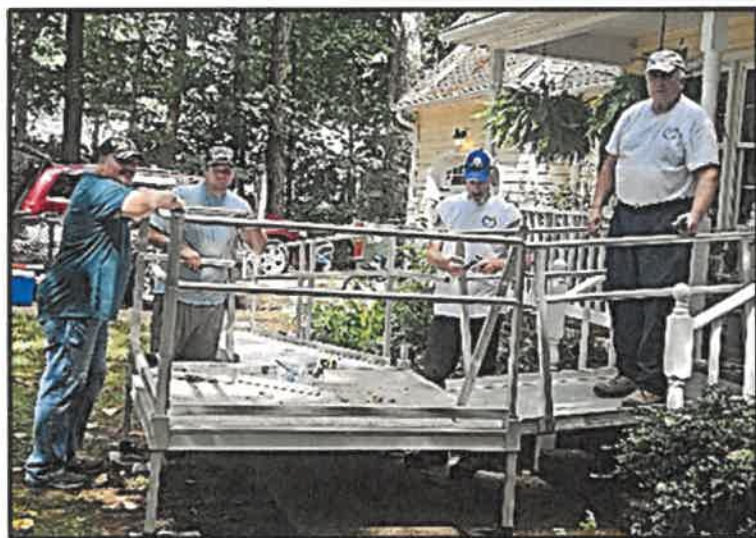
Connection with Beulah BC