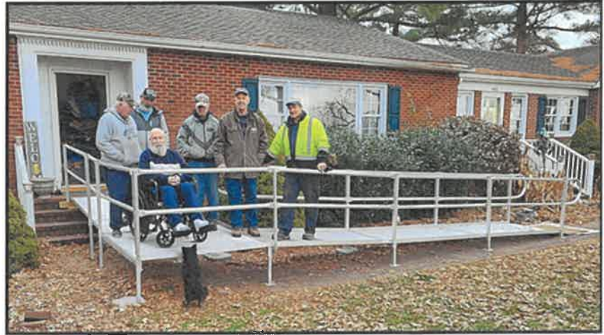
(connection with Poroporone BC)