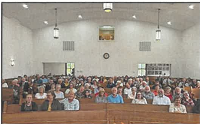
Gwynn's Island BC 150 th anniversary on Oct. 6.