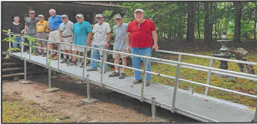
(connection with Corrottoman BC)

Our MTBA Servant Hearted workers continue to “love their neighbor as thyself” by building ramps for people having difficulty entering and leaving their homes.