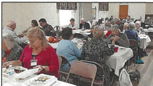
Great fellowship and delicious food, hosted by the good folks of Olivet BC. Thank you!