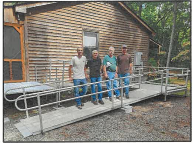
(connection with Mathews BC)