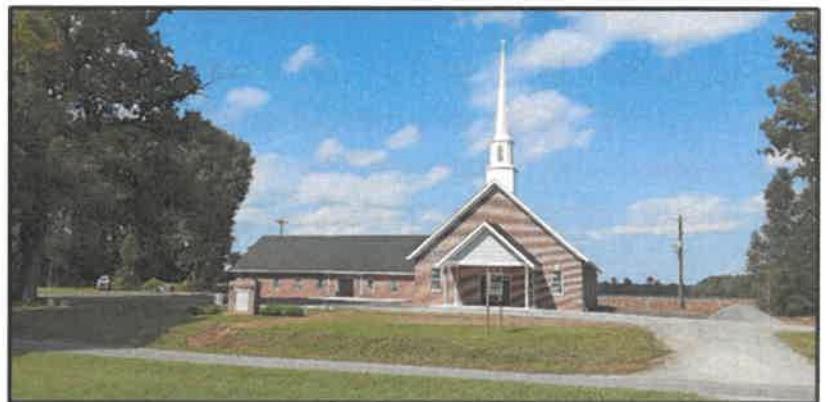
Lower King & Queen BC , in new building Nov. 17.