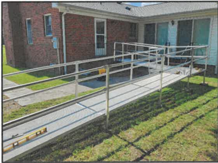
(connection with Glebe Landing BC)