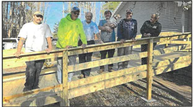
(connection with Poroporone BC)