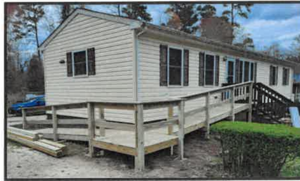
Connection with Beulah BC & Mathews BC