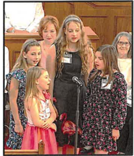
Associational Choir (l). Corrottoman BC Children's Choir (r)