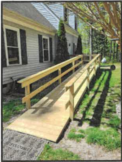
Connection with Beulah BC

Ramp-It Up Mission project is still an on-going need in our communities. Since January 1, five ramps have been built , and additional ramp requests continue to be received. Below are three recent ramps built by our faithful servants. Thank you servant workers and thank you, MTBA, for giving monies to Week of Prayer Missions' Offering.