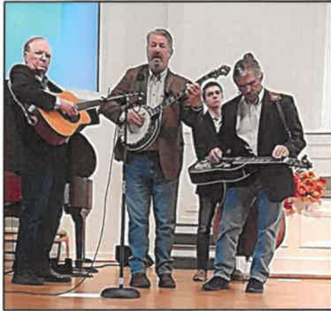
“Rappahannock Crossing” band led our gathering in Worship through music.

A motion was approved to receive Corrottoman BC in Lancaster into MTBA.