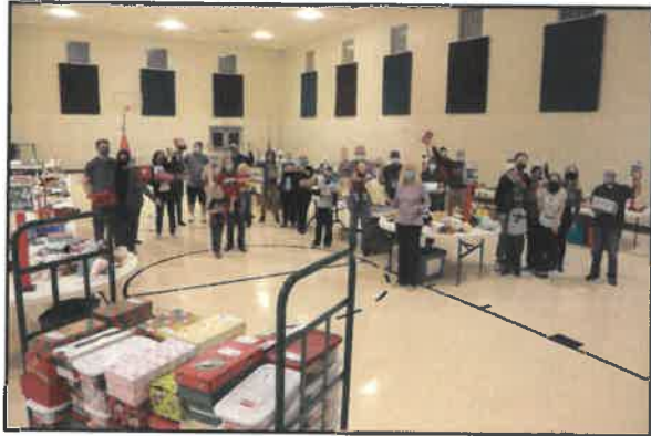
Newington BC OCC