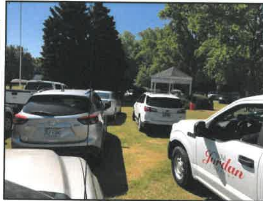
Gwynn's Island BC drive in from gazebo