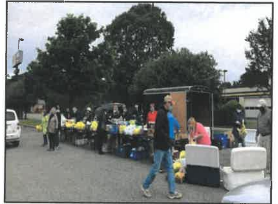
Olivet BC "Helping The Homeless" food distribution