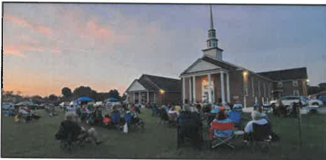
Poroporone BC revival