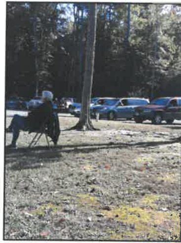
Beech Grove BC drive in