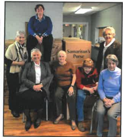
Harmony Grove BC Operation Christmas Child