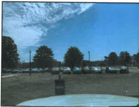
Hermitage BC drive in