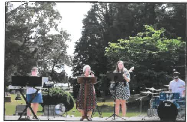
Farnham BC praise singers at drive in