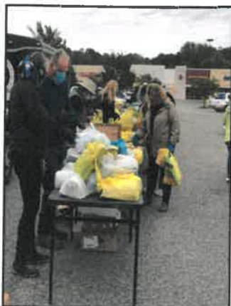
Lower King & Queen BC "Helping the Homeless" drive thru food distribution