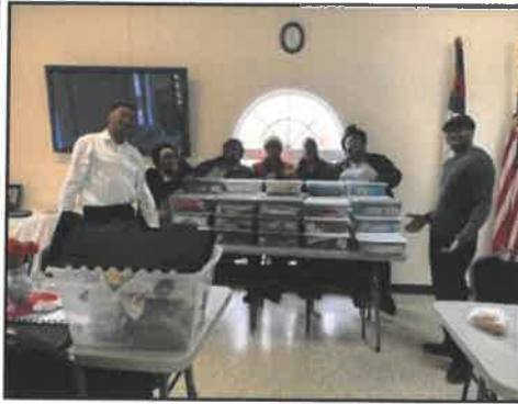
New Hope Fellowship Operation Christmas Child shoe packing