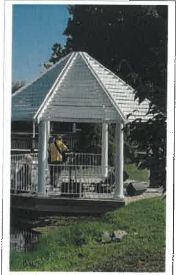
Urbanna BC campground worship