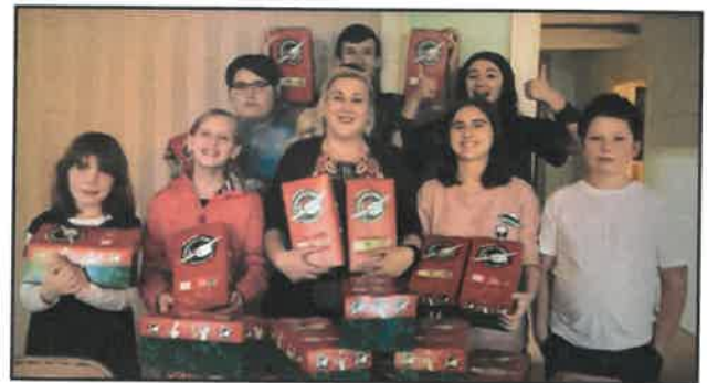
Bruington BC Youth group event, Samaritan's purse Christmas boxes