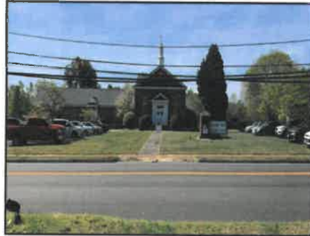
Saluda BC drive in