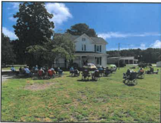
White Stone BC worship on yard of Friendship House