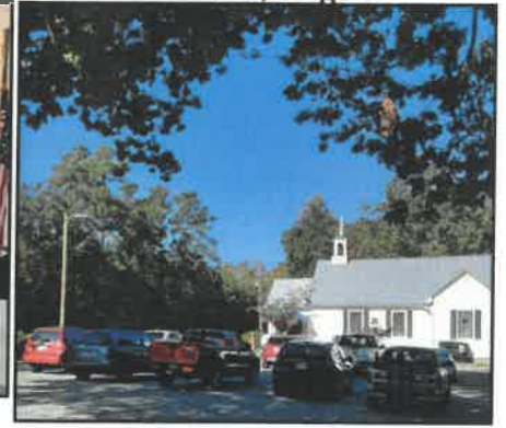
New Hope Memorial BC drive in