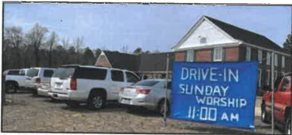
Glebe Landing BC drive in