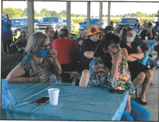
Beale Mem. BC fellowship under pavillon