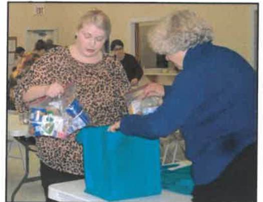
Macedonia BC snack packing