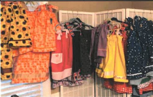
Dresses made for Occ