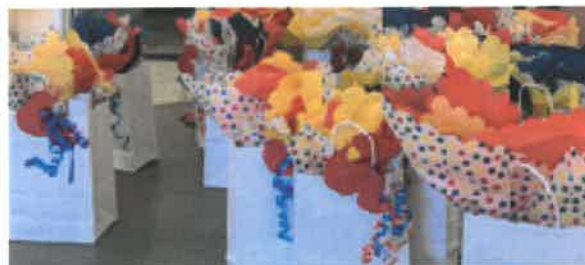
Children’s Sunday School lessons and treat bags