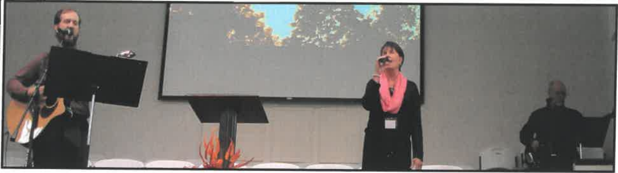
Pre-concert by Newington BC