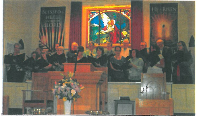
(Above) The Poroporone Baptist Church choir provided special music for the service.